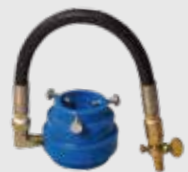
Wet Head Assembly