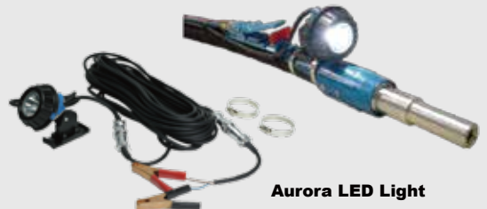
Aurora LED Light