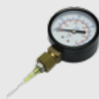
Hypodermic Needle Gauge